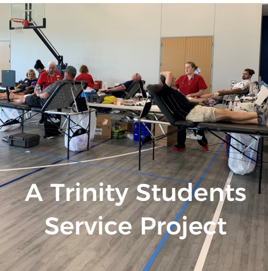
A Trinity Students Service Project

Pizza, student store, pop and snack machine (cash only), open gym, games, worship, message, small groups