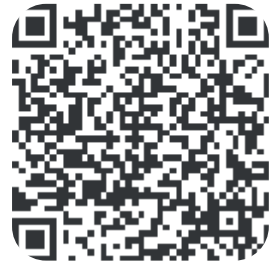
Church Center App

Women's Ministry continued to pursue and live out our purpose to connect women to Christ and to one another. Did you know that there are 518 women actively connected to our church? Vital to this are our Serve Teams. Some are year round groups while others tackle a specific event. Check out what they accomplished in 2024.