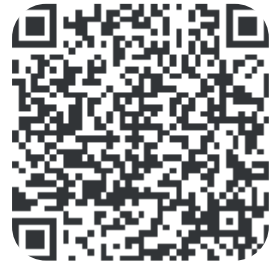
Church Center App

Women's Ministry continued to pursue and live out our purpose to connect women to Christ and to one another. Did you know that there are 518 women actively connected to our church? Vital to this are our Serve Teams. Some are year round groups while others tackle a specific event. Check out what they accomplished in 2024.