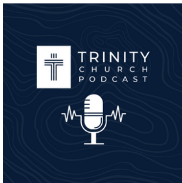
Follow us on YouTube @trinitypapillion